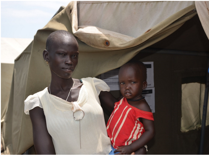
Pamdong Transit center © Mishisalla Beyene /August 2014